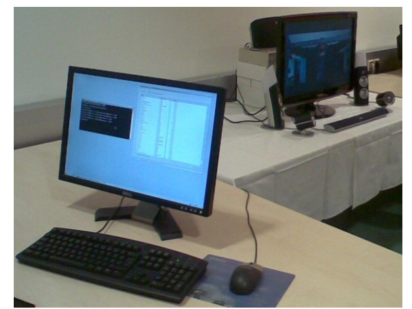
Figure 4. Test Setup with a Control Station (Foreground) and the Actual Test Computer (Background).

The other two test setups (i.e., Figure 2 (b) and (c)) using multiple amBX systems and additional sets of Cyborg