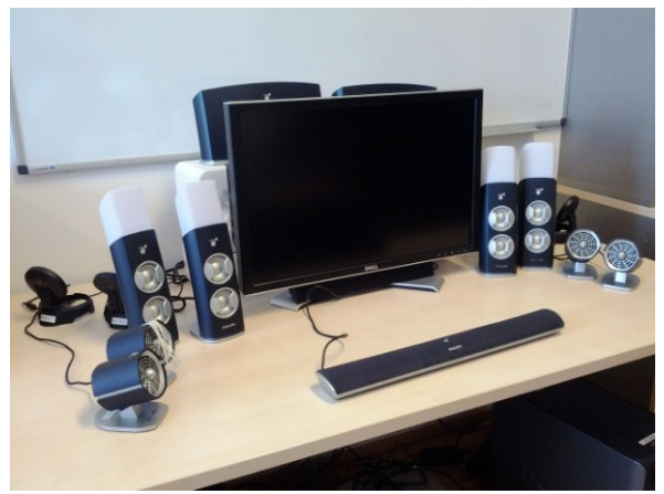
Figure 3. Test Setup with Two amBX Sets and Two Cyborg Gaming Lights.

of only having two small lights on the left and right of the display. Furthermore, the colors of the Cyborg Gaming Lights are more light-resistant than the provided lights of the amBX system.