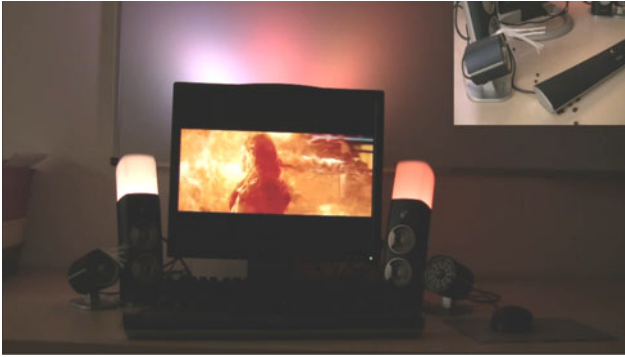
Fig. 2. Enhanced Video Playback with SEMP

Participants will be able to try SEMP and AmbientLib . We believe that the possibility to experience the sensory effects first hand will trigger discussions on this research. A small example of the demonstration is depicted in Fig. 2 (the fan in action is depicted on the upper right corner).